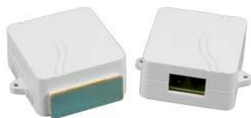
HTemp-1W Box2 600 344