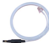
Humid-1Wire 3m 600 279