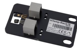
HTemp-Rack19 600 330