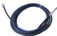
Temp-1Wire-Outdoor 3m 600 311