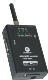
TG20 GSM modem